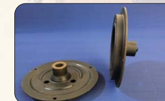
Metal + Rubber