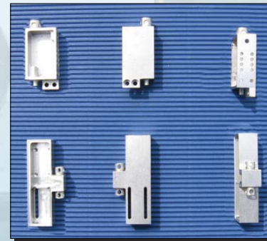
M.I.M. New Technology