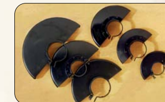
Metal + Welding