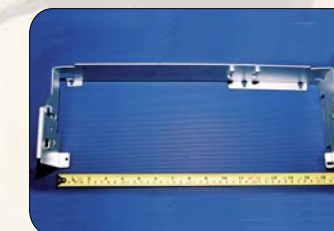
Length 1.2 Meter