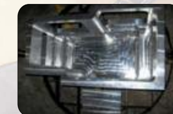
Size : 900(H) x 500 (D) x 600(W)