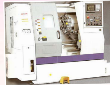
Crucible Aluminum Alloy T4 Heat Treatment Furnace