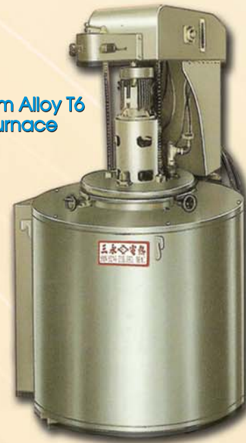
Crucible Aluminium Alloy T6 Heat Treatment Furnace

Billion Fortune Sdn. Bhd. was incorporated since 1994 in Malaysia, a private limited company in metal-based industry. Presently we provide metal components and T4 / T6 Aluminum heat treatment services to the manufacturing sector in various industries with our integrated facility of metal forming, mould & die design and fabrication, and precision machining. Our wide ranges of efficient metal forming machines are equipped with the capability to carry out stamping, forging and multi-forming processes. The tonnage capacity of these machines range from 16 to 400 metric tonnes, enabling them to produce a variety of metal press components. We also provide in-house secondary process such as tapping, grinding, sand blasting, buffing, sport welding & argon welding.