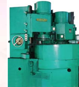
→ 1 unit